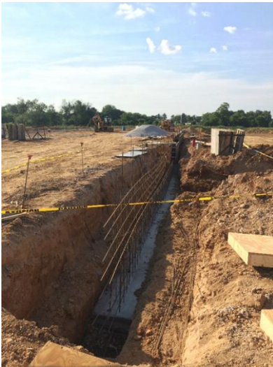
Perimeter Foundations (D)