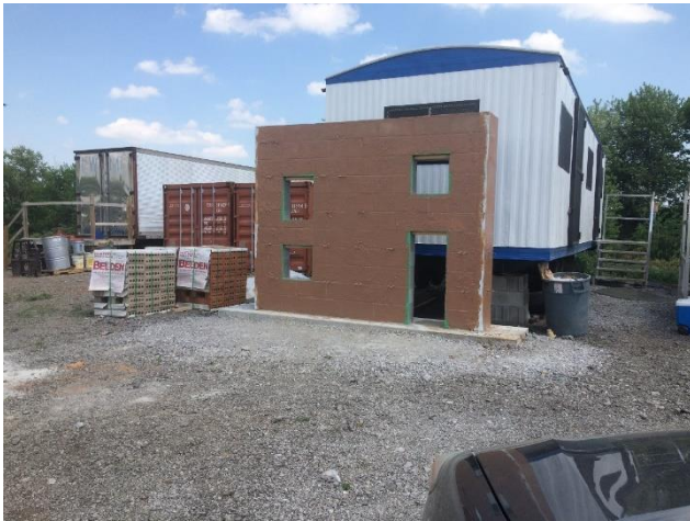
Exterior Wall Mockup