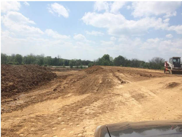
Final Lifts – Sector A