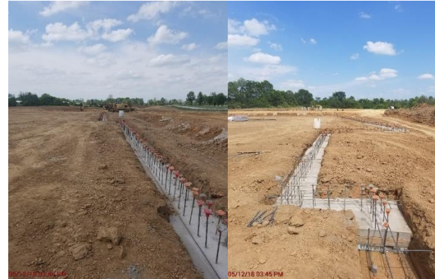
Foundations – Sector C